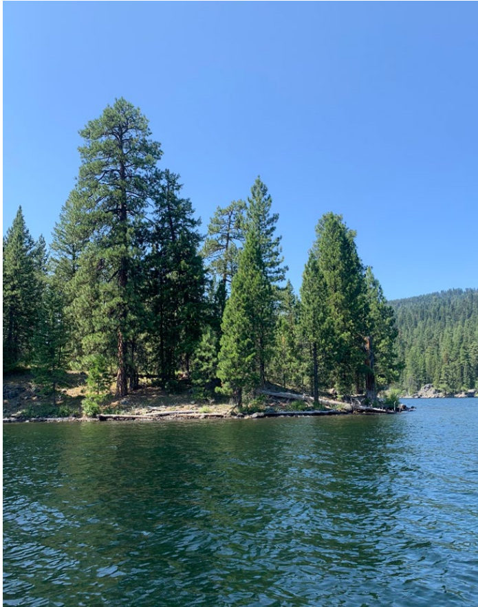
East Side Lot 1