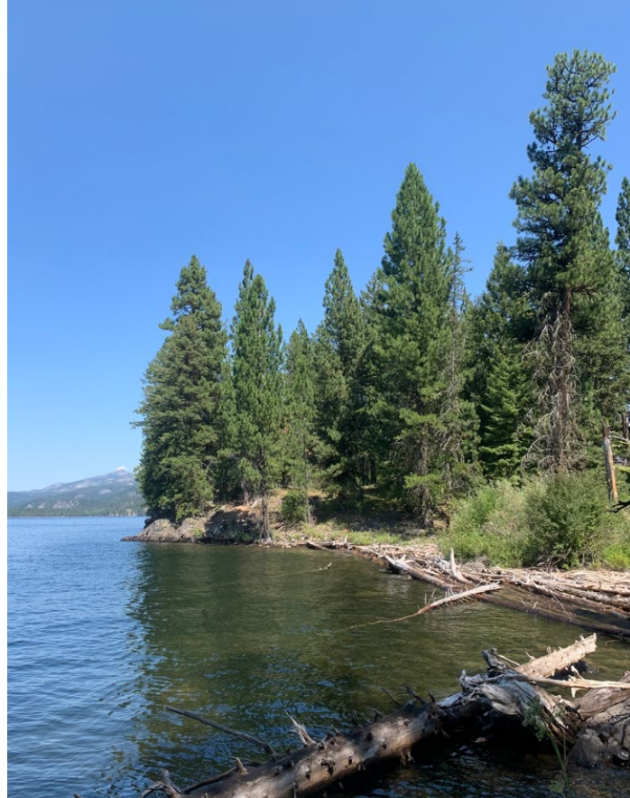
West Side Lot 1